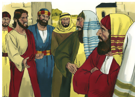
"Bruh you won't"